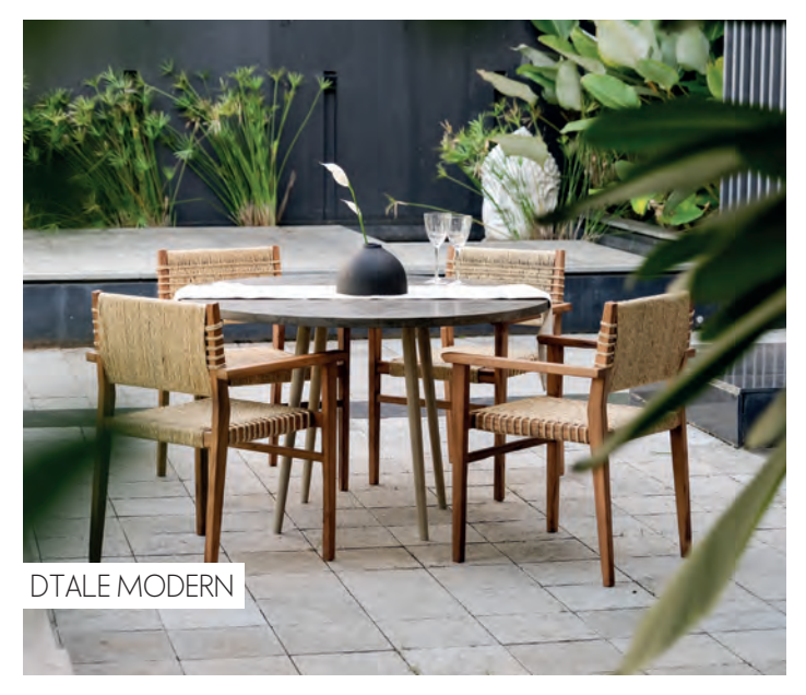
CLOCKWISE FROM TOP LEFT "ORIGIN" COLLECTION by Mario Ruiz for Point., available at Beyond & More "MBRACE" COLLECTION by Giulio Ridolfo and Sebastian Herkner for DEDON, available at Etreluxe, all prices on request "ALFRESCO" OUTDOOR SET, part of the Outdoor collection by Sunday, ₹3,90,000 "NESH" CEMENT FINISH DINING TABLE AND "KNOX" HANDWOVEN CHAIR by Dtale Modern, price on request

Skillfully designed with robust materials, the outdoor decor is defyingly delicate. Pick from a variety of styles and match it with your mood